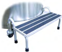
Optional Step for 800 Series

There is a critical temperature for most biological samples that are cryopreserved. This critical temperature is known as the Glass Transition Temperature (T g ) of water, which is widely accepted as being in the order of -130° to -135°C. The long-term viability of frozen samples can be seriously compromised if stored above this temperature range. Further, if they experience several transitions through this range in either thermal direction, additional deterioration may occur. It is important that the LN 2 freezer maintain a lower temperature, even during filling and sample retrieval cycles. This is much more likely to be achieved if the freezer maintains a temperature of -190°C than if the system is at or near the critical temperature at