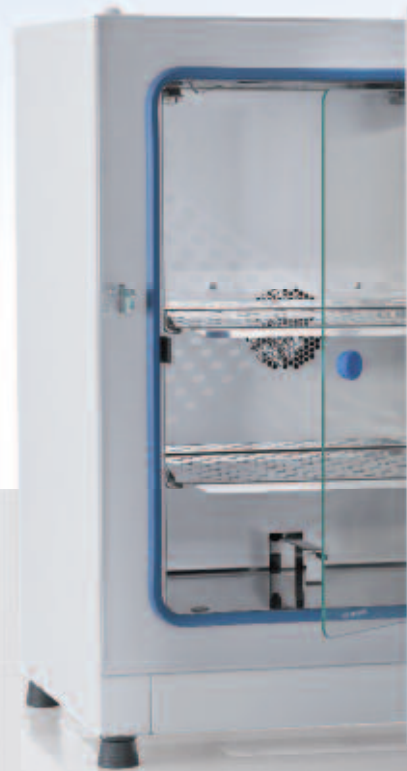
Thermo Scientific Heratherm Advanced Protocol Security microbiological incubator with unique dual convection