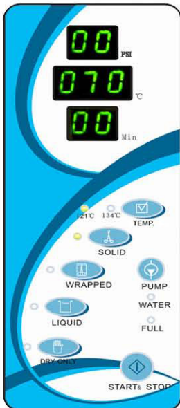
Control Panel (BioClave 16)