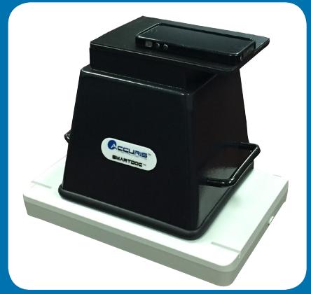
Use with SmartDoc™ for gel imaging with a cell phone