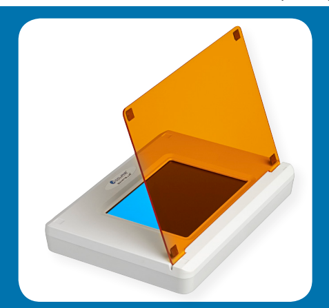
Amber cover raised for easy gel access

An array of super bright LEDs with a long, 30,000 hour service life provide the light source for the SmartBlue Transilluminator. Unlike those in a UV transilluminator, the filters in the SmartBlue will not solarize and degrade in performance over time. Gel bands can be excised directly on the scratch resistant, glass viewing surface. To save energy, the power switch includes an automatic 5 minute shutoff. The SmartBlue Transilluminator is covered by a 2 year warranty.