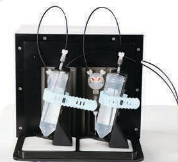
Automatic Injection Module

The SmartReader Multimode is capable of luminescent detection and can process both flash and glow assays. An advanced PMT (photo multiplier tube) enhances sensitivity of weak signals, prevents over-saturation of strong signals, and provides an ideal detection range for all common luminescence applications. Up to 2 sample injectors (available separately) can be installed and are compatible with both 96 and 384-well plates.