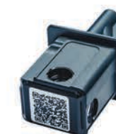
Fluorescence Filter Module

Three filter modules are included to provide the most common excitation and emission wavelengths needed for fluorescence assays. Additional filter modules are available. These advanced modules incorporate dichroic mirrors with narrow band-pass optical filters and ensure high light transmission, increased detection sensitivity, and are easily exchanged. Modules are barcoded for automatic loading of wavelength data. The SmartReader Multimode allows for automatic dynamic range selection, which allows for the gain of the photomultiplier tube to accurately capture and normalize the signal intensity of samples.