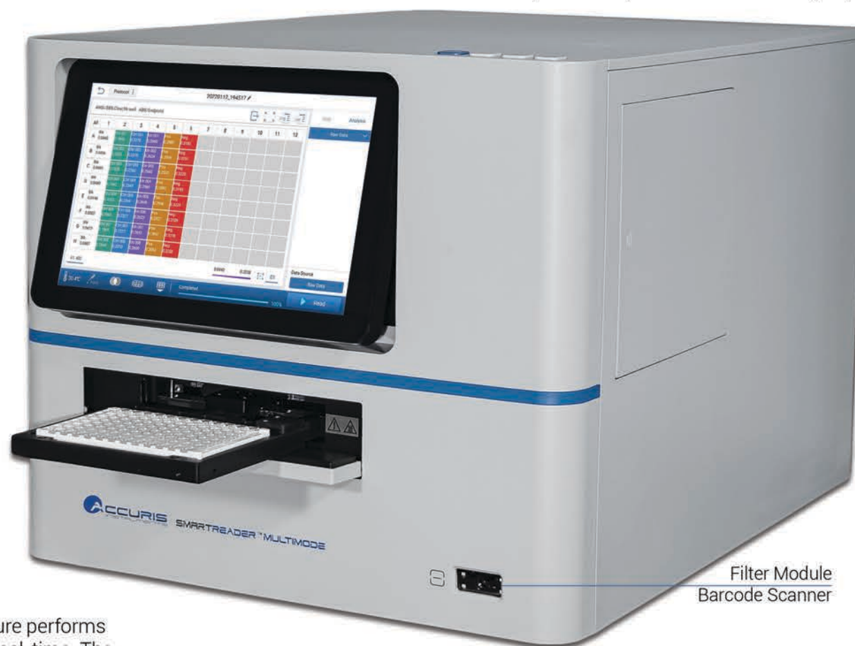
Filter Module Barcode Scanner