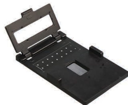
SmartDrop™ Accessory Plate