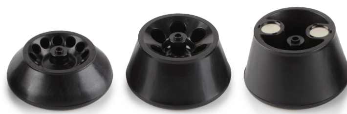
1.5/2.0 mL Tube Rotor 5 mL Tube Rotor Stirrer Rotor